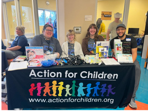
Action for Children