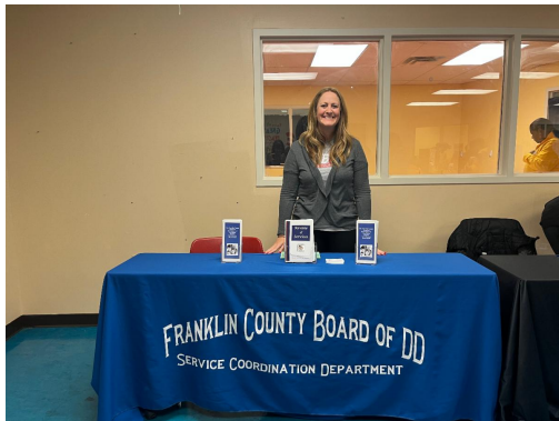
Franklin County Board of Developmental Disabilities