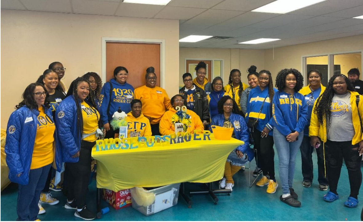
Iota Nu Sigma Alumnae Chapter of Sigma Gamma Rho Sorority, Inc.