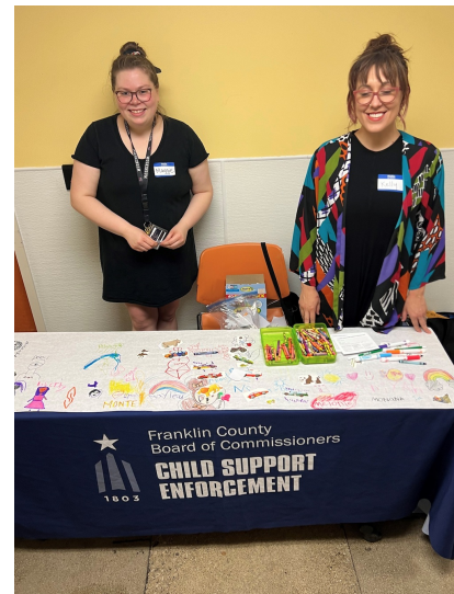
Franklin County Board of Child Support Enforcement